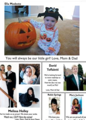
Quarter page ad